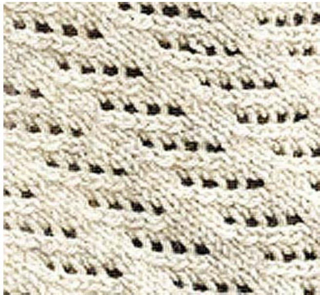
Enlarged pattern detail